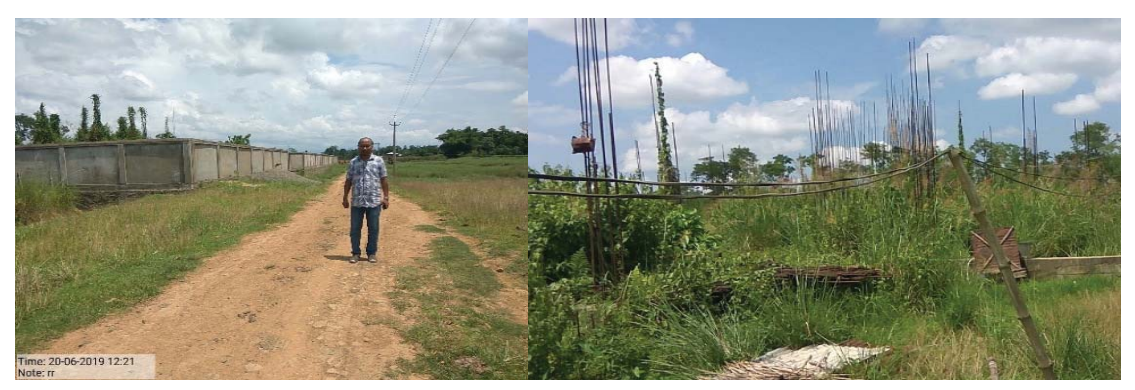
Date of photograph:-20 June 2019

The contractor's payments for executed works were delayed by two years. The additional items like boundary wall, which were executed at the behest of the PSD, were not approved by the PWD.